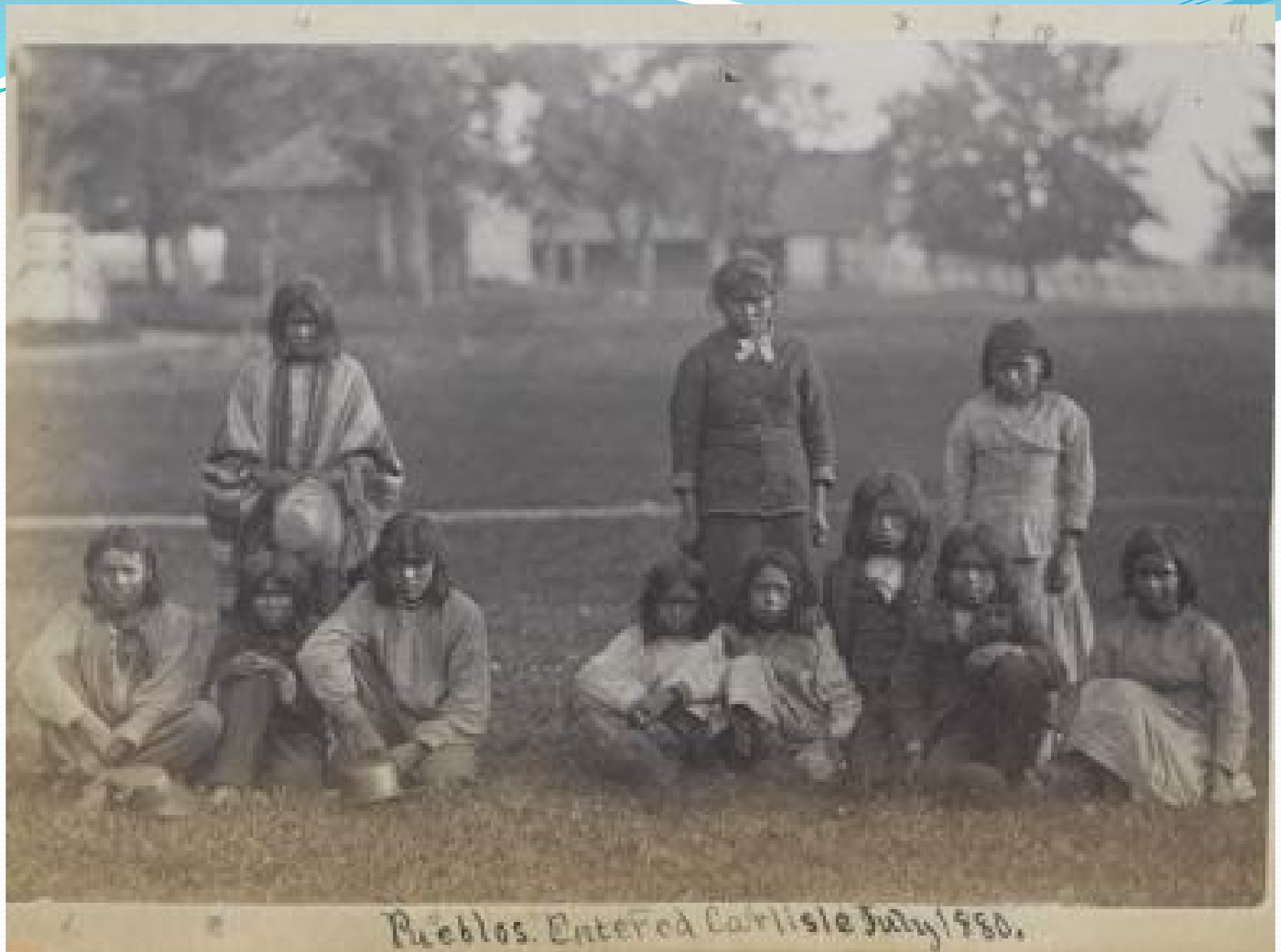
Pueblos. Entered Carlisle July 1980.